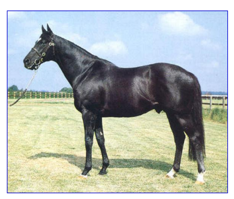
Known Fact was a Champion Miler in Great Britain at 3.

Rabiadella, the second dam of Asunder, won 7 races, earned $263,450 and was a double Grade 3 winner on the Southern California circuit, taking the Senorita Stakes around two turns on turf at Hollywood Park and the Monrovia sprinting on grass at Santa Anita.