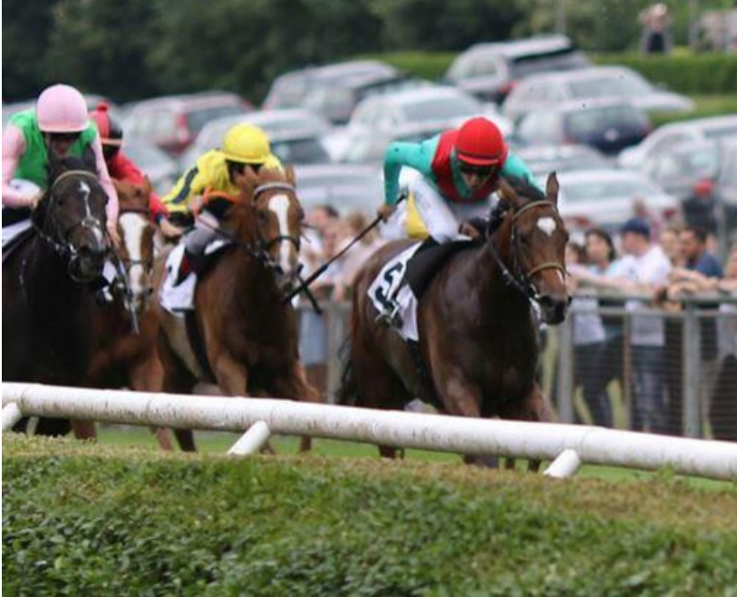
Go Rose temporarily surges to narrow lead in the final furlong.

Go Rose, making only the third start of her career, once again showed a remarkable brand of courage when gamely missing second on a head bob in the Classic, Group 2 German 1000 Guineas to the same filly in Malakeh that beat her a head for the Listed win in her debut at 3. The replay is here .