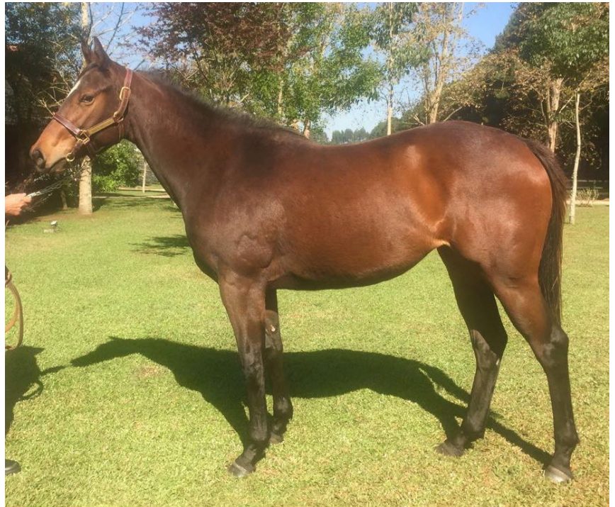
Seneca has grown into a well-developed young filly in Brazil.

SENECA was photographed Saturday in Brazil, where the Team Valor-bred yearling filly by ex-U. S. racehorse and sire Forestry is in about August if she were in North America. The daughter of Grade 1-winning Kentucky-based mare Sutil, which has an Animal Kingdom filly foal in the Bluegrass, will begin her racing career in Brazil and be imported if she proves to be good enough. Her sire was represented in AK's foal crop by the Preakness hero Shackleford. The mare was bred to Breeders' Cup hero Tourist this season.