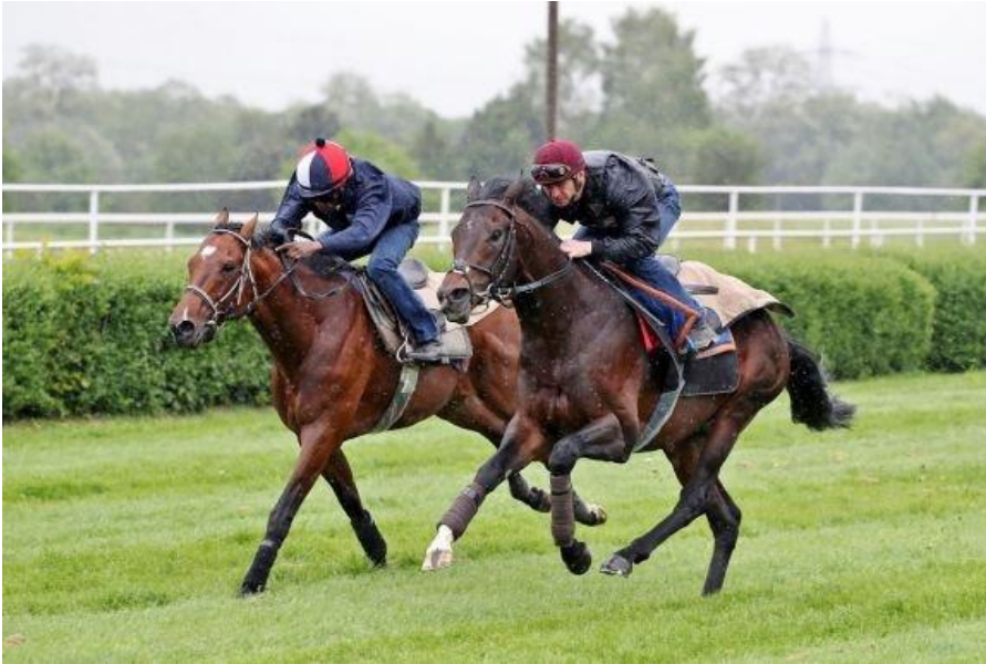
Va Bank's prep race was canceled a few weeks ago but he got in a racecourse gallop at Dortmund (red, white and blue cap).

The last year or so has been forgettable for Va Bank, but he is now sound and flashing signs of his old self with a new, top-class trainer, so hope is rekindled as he begins 2018 with a stiff assignment on Thursday in the Group 2 Badener Meile in Germany.