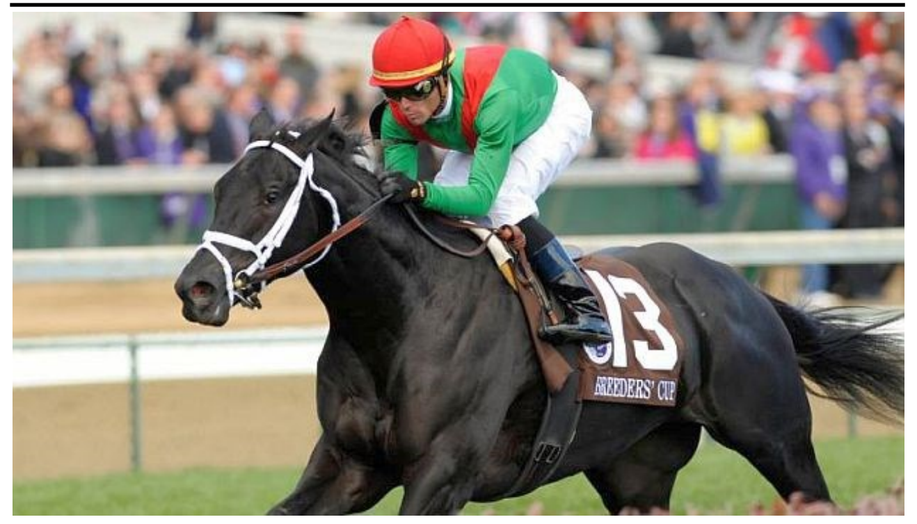
SA-connected colt, Pluck, overcame an adventuresome trip to win the 2010 Breeders' Cup Juvenile Turf by a length under jockey Garrett Gomez. (breederscup.com)