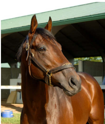
Sailor's Cap inspires confidence.

The Colonial Turf Cup has attracted a salty group. Of the 10 colts entered, 4 are Graded stakes winners, including Kentucky Derby also-ran, Court Vision, winner of last year's Iroquois and Remsen Stakes; Sporting Art, the winner of the Palm Beach Stakes and the Calder Derby; Boss Lafitte, winner of the Transylvania Stakes; and Adriano, the son of AP Indy who captured the Lane's End Stakes. Kentucky Bear, third in the Blue Grass Stakes on Polytrack, tries grass for the first time tomorrow.