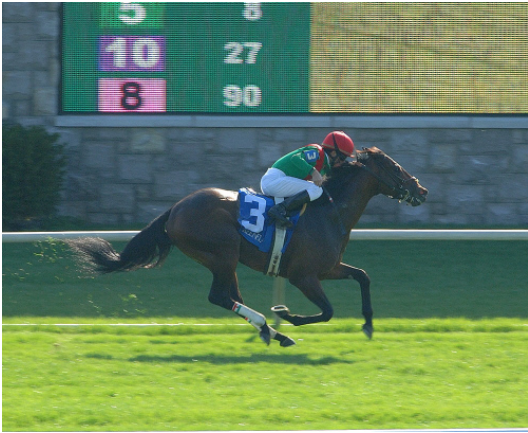
Sailor's Cap was impressive at Keeneland.

Sailor's Cap, an athletic son of Distant View, is coming into the Turf Cup off of two stellar efforts. His 3-length win at Keeneland in April, which was followed up by a game second-place finish in the Grade 3 Crown Royal American turf at Churchill Downs in May, have stamped him as a serious contender for the Turf Cup. Sailor's Cap has garnered the respect of the odds-maker at Colonial Downs, who has installed him as the 7-2 second choice in the 10-horse lineup.