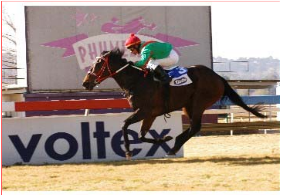
She's on Fire, from 10 hole, is now 14 to 1, below only five other July starters.

So, in an odd turn of events, she picks up weight for winning a Grade 3 race, while Russian Sage and Dancer's Daughter carry not an ounce more than originally assigned even though they have won Grade 1s since because their wins came under w-f-a conditions. On a positive note, the mare drew exceptionally well in the 10 hole for the Durban July—smack dab in the middle of the 20 horses for the winter Classic.