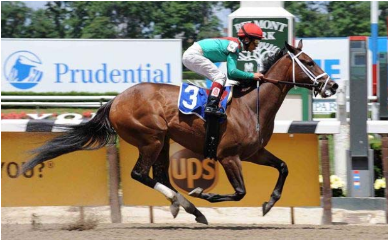
Collegiate wins with her ears pricked first time out at Belmont.